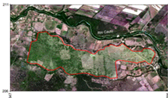
Figure 1. Satellite photo of the study area.

Is located in the Empresa Agropecuaria Jiguaní, in the eastern region of Cuba, downstream of the confluence of the Cauto and Contramaestre rivers. Located 35 km northeast of Bayamo, the provincial capital of Granma, at the geographical coordinates 20°31'25" north latitude and 76°20'24" west longitude, at an altitude of 50 m.